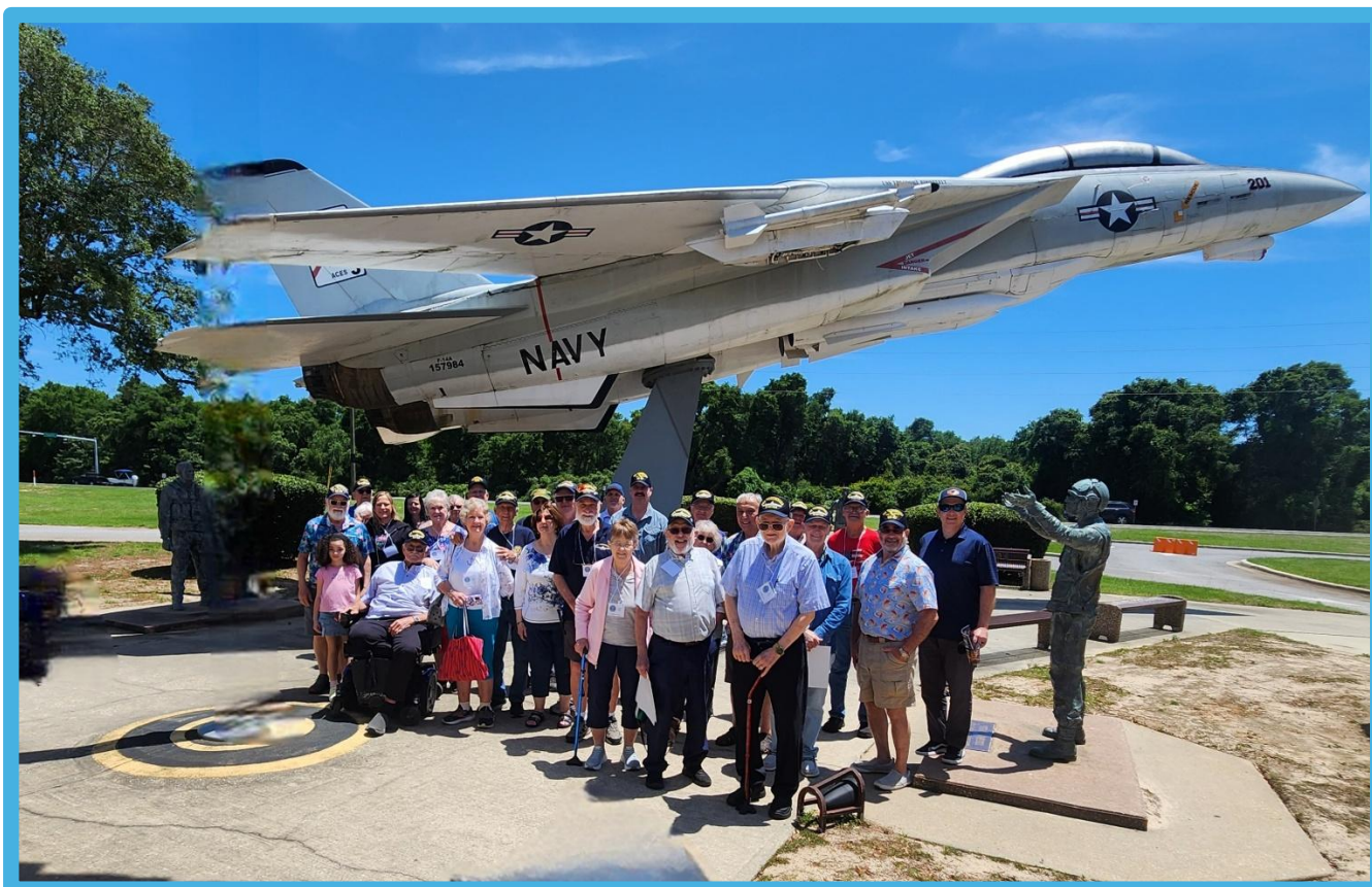
Ticonderoga tour group at Nat'l. Naval Aviation Museum, NAS Pensacola, FL Fly Navy!