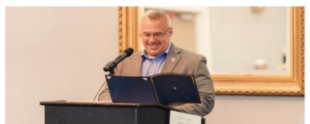
Photos from the 53 rd Annual Ticonderoga Reunion in Mobile, Alabama