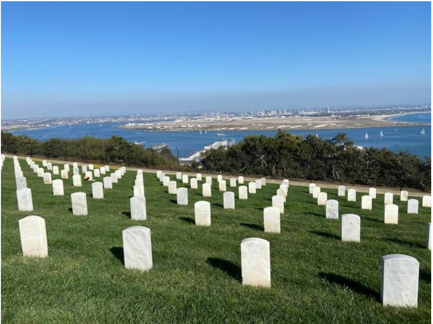
Fort Rosecrans National Cemetery, Point Loma, California