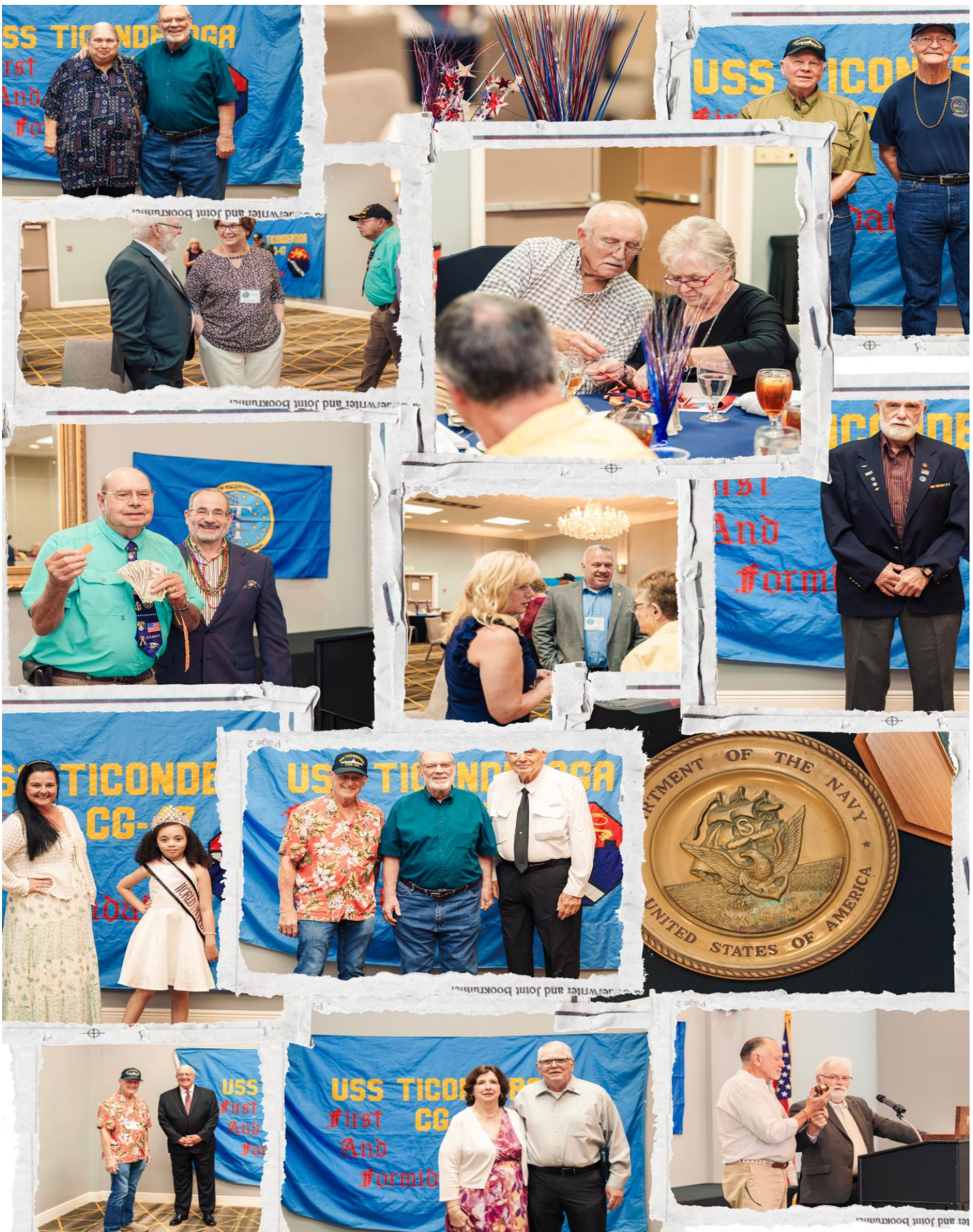
Photos from the 53 rd Annual Ticonderoga Reunion in Mobile, Alabama