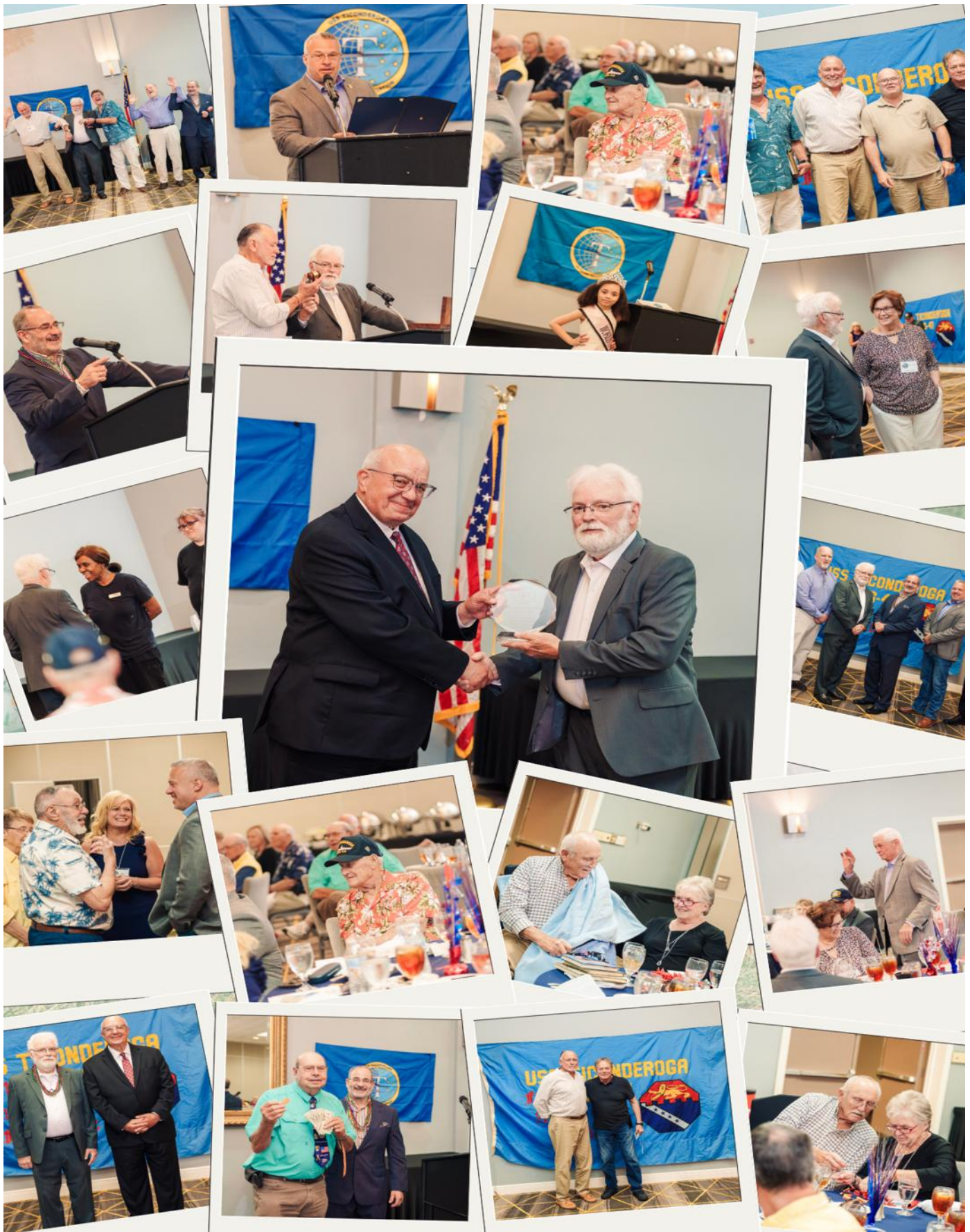
Photos from the 53 rd Annual Ticonderoga Reunion in Mobile, Alabama